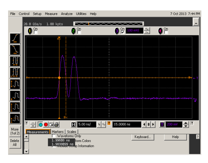
Figure 3: Second-order fault injection attack — proof of concept

We detail below the technical characteristics of a fairly high-end bench<sup>4</sup>: